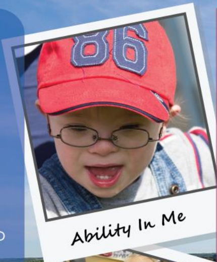
Ability In Me

Annually, Riverside VIPOND funds early educational programming for children with Down Syndrome as provided by Ability In Me and enables children with disabilities to attend a summer camp operated by CLASI. Elmwood Residences and Cosmo have benefited with facility upgrades such as a whirlpool for therapy, a fitness centre, a Snoezelen sensory room, a cafeteria, a gym, and many other capital projects.