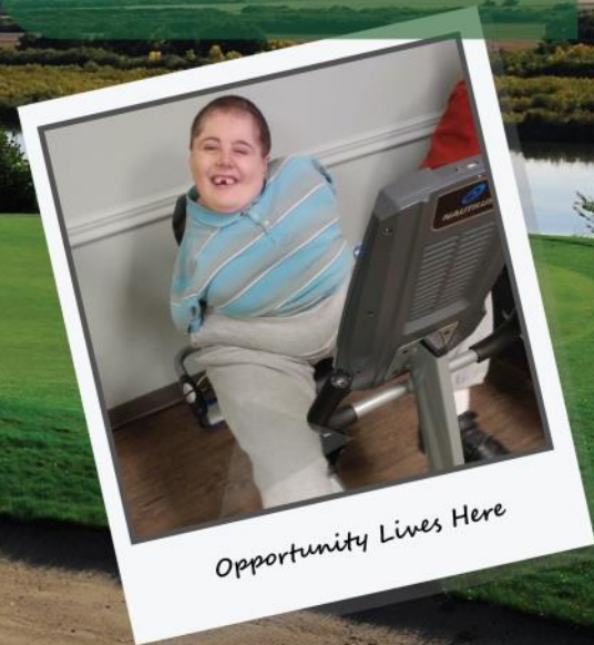
Opportunity Lives Here